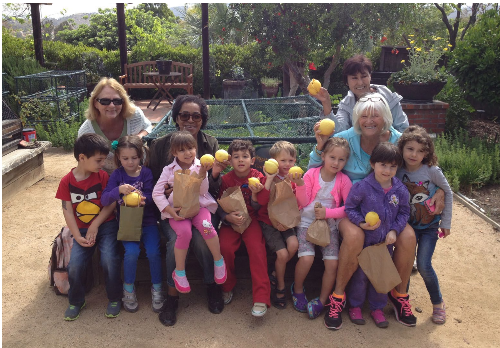
Older adults and youth participate in the Five & Fit obesity prevention program hosted by the County of San Diego

Generations United is working with APA on a guide to integrate intergenerational issues and strategies into city and county planning efforts. The guide stipulates that the well-being of young and old and the connections between them should be critical factors in shaping all aspects of community planning — transportation, housing, parks, schools and more.