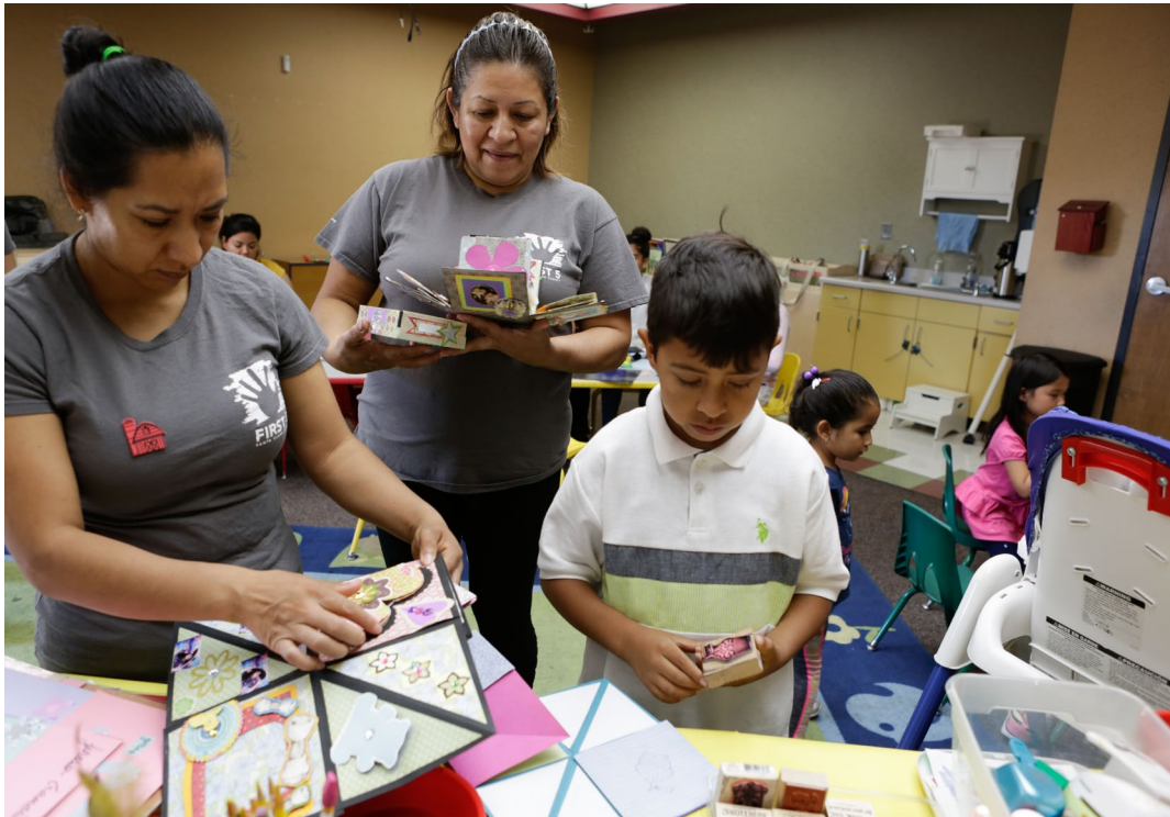
Scrapbooking workshop with Gen2Gen volunteers at Family Resource Center in Santa Clara County.