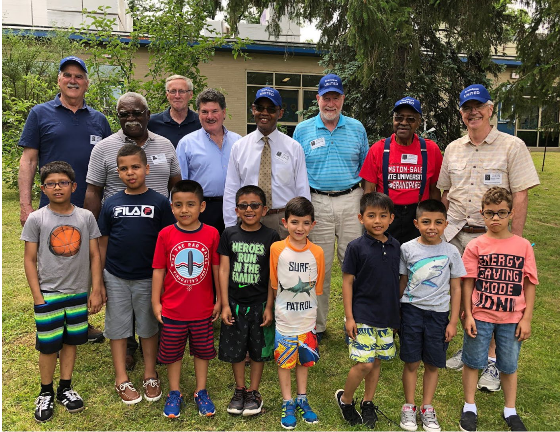
Members of Grandpas United support youth in White Plains, New York.