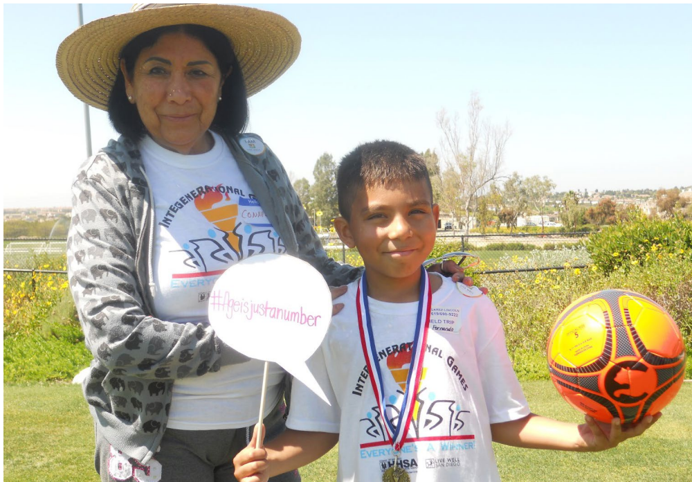
An adult and student at the Intergenerational Games hosted by the County of San Diego and multiple community partners.