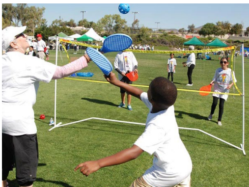
The Intergenerational Games are sponsored by the County of San Diego and multiple community partners.