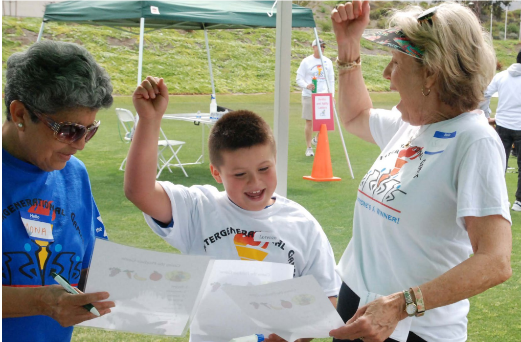
Older adults and students at the Intergenerational Games hosted by the County of San Diego and multiple community partners.