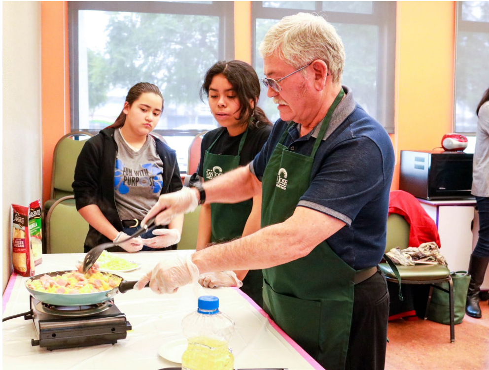
Gen2Gen pilot project at the Mayfair Community Center.