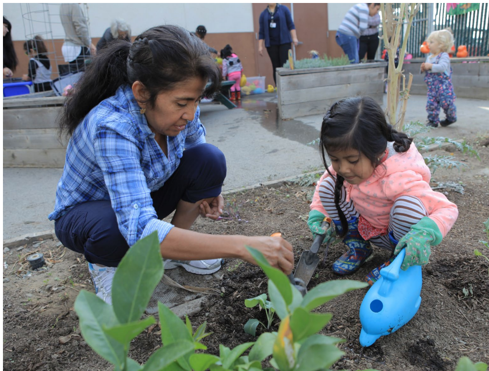
Intergenerational gardening at a Family Resource Center supported by FIRST 5 Santa Clara.