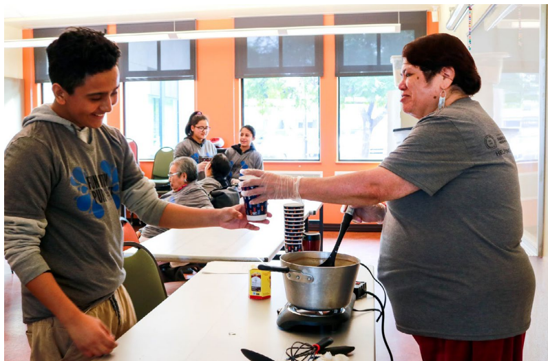
An older adult and student cook Mexican hot chocolate together in San Jose.

Try Generations United's Intergenerational Evaluation Toolkit to measure impact and gather data on how to modify and improve your program.