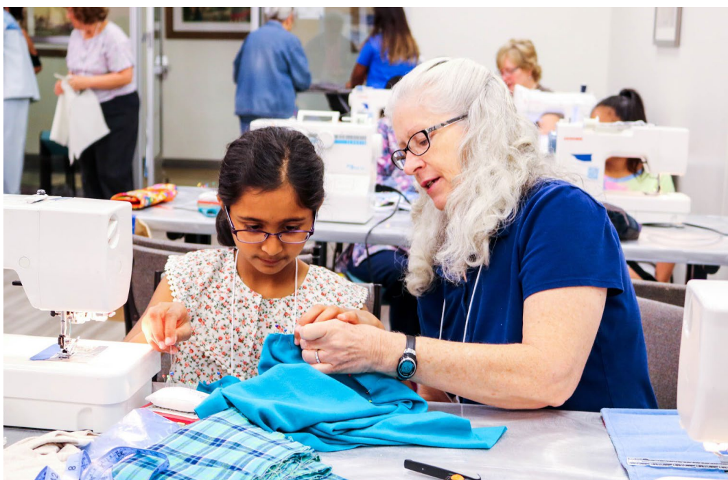
An intergenerational sewing camp at Seven Trees Community Center in San Jose.