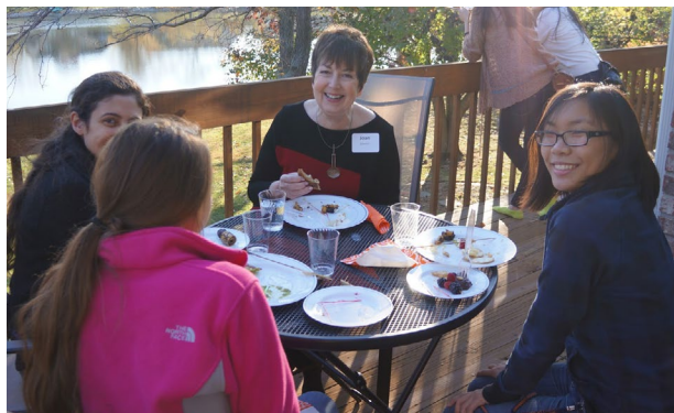
Members of UIUC's I Promise mentoring program.

By the time Gershenfeld left her role in 2015, students were choosing adult mentors over peer mentors by a ratio of 9 to 1. More recently, the program shifted to an exclusively adult mentor model based on student feedback.