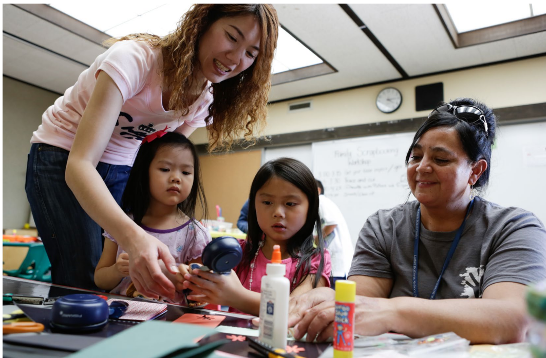
Three generations at Family Resource Center funded by FIRST 5 Santa Clara.